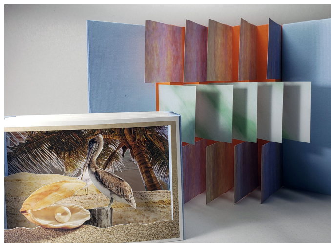
Keri Miki-Lani Schroeder

Tuition: $165 (Members: $150) | 1 session