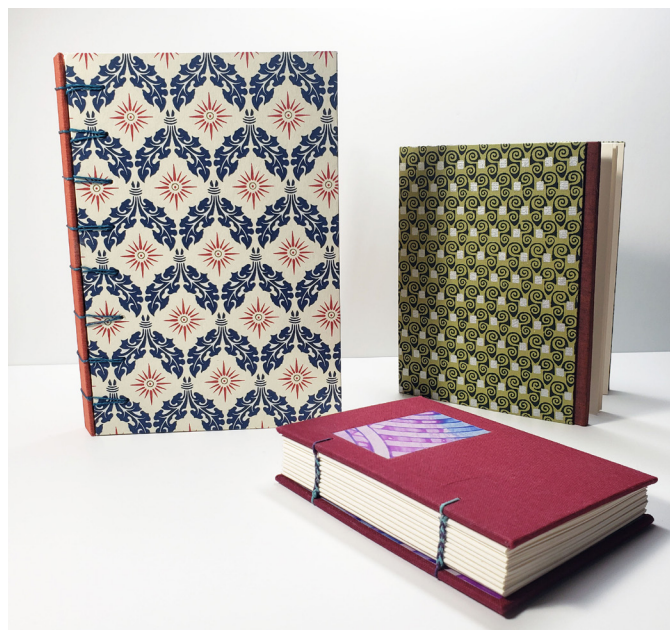
Keri Miki–Lani Schroeder

Tuition: $200 (Members: $185) | 2 sessions